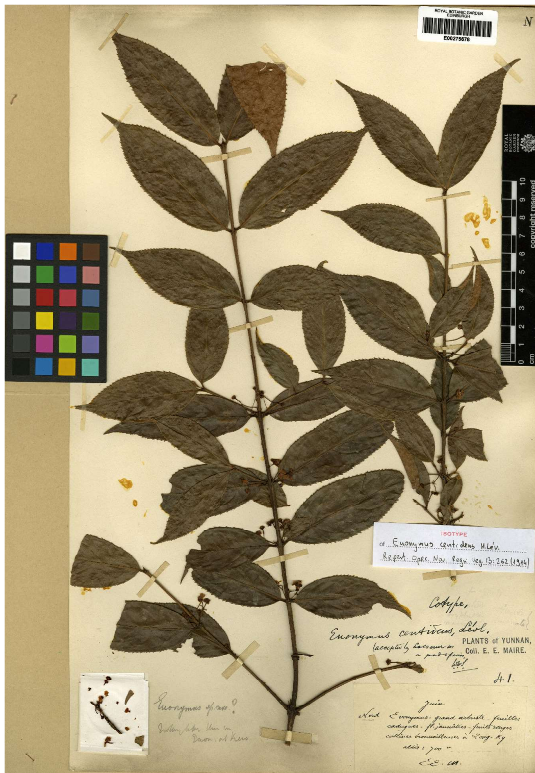
Fig. 3. Isotype of Euonymus centidens H. Lévl., E. E. Maire s.n. (Royal Botanic Garden, Edinburgh (E), E00275678, photograph).